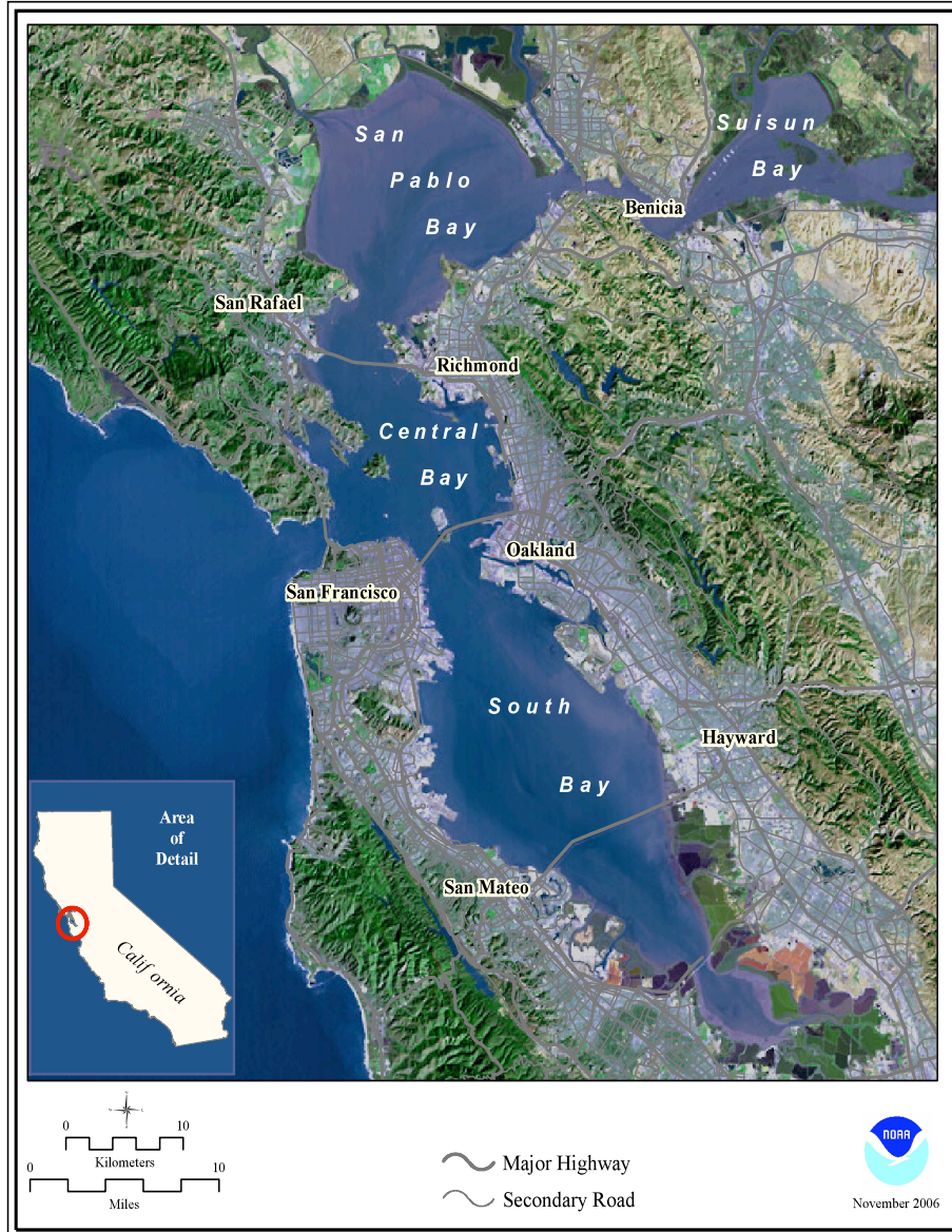
Figure 1. San Francisco Bay Subtidal Habitat Goals Study Area